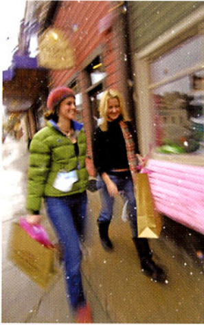
above: Shopping in Park City right: Snowbird Ski & Summer Resort below left: Cliff Spa pool below right: Snowbird tram